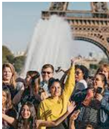
DAY TOURS & EXCURSIONS