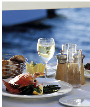
DINING & ENTERTAINMENT RESERVATIONS