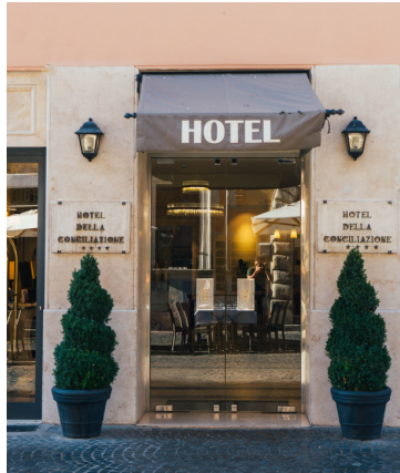
HOTELS, VILLAS & APARTMENTS