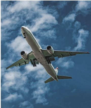
DOMESTIC & INTERNATIONAL AIR

Having your own professional and certified travel advisor is like having a private concierge for all things travel - qualified, experienced, knowledgeable, connected, and always working to make your next trip the best one you've ever had.